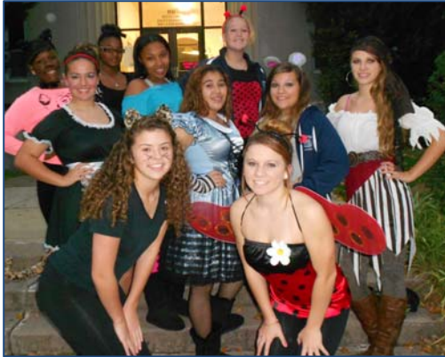
Thank you to the high school cheerleaders for helping at Lincoln's Fall Family Night