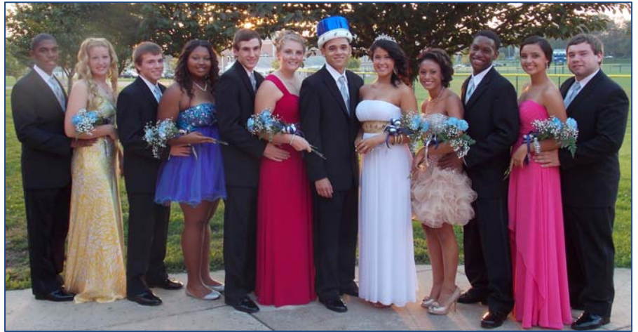
2012 Homecoming Court